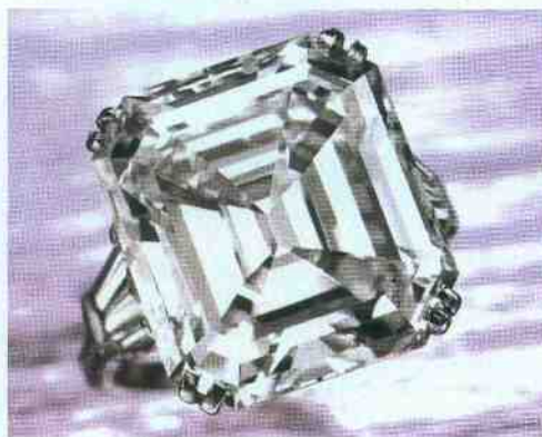
At the same auction, a rectangular-cut D/VVS 2 , Type Ila diamond ring (23.14 cts.), by Harry Winston , sold for $2,617,000 ($113,000 per carat).