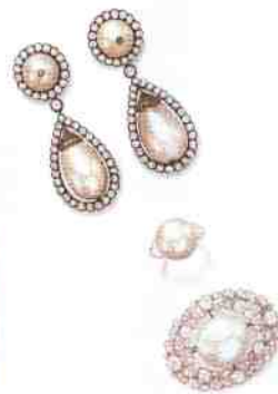
The Baroda Pearls comprise a two-strand natural pearl necklace, ear pendants, a brooch, and a ring en suite. The set sold for $7,096,000, a world auction record for a natural pearl jewel, at Christie's Magnificent Jewels Auction, April 25, 2007.