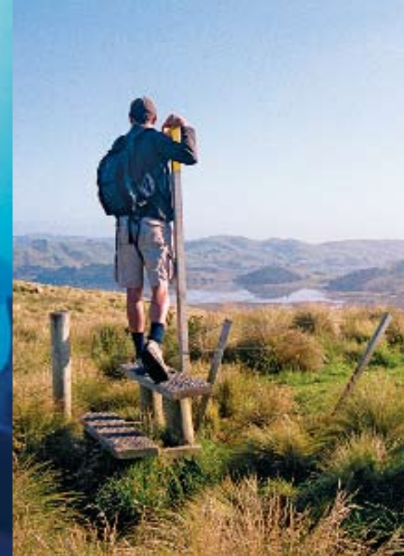
FROM OPPOSITE PAGE, LEFT TO RIGHT: A hang glider catches thermals above Queenstown, the South Island's adventure-sports capital; dusky dolphins frolic in the waters off Kaikoura, on the island's northeast coast; a hiker stops to admire the view on the Otago Peninsula, near Dunedin.

Q UEENSTOWN calls itself the Adventure Capital of the World—a sign at the city limits announces this—but there is no need for bungee jumping or jet boating to get your thrills on New Zealand's South Island. You'll have plenty without ever leaving the car, especially if you find yourself driving through