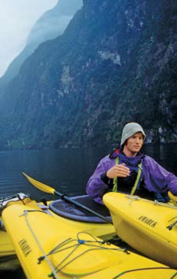
ABOVE, LEFT TO RIGHT: Kayakers on Milford Sound, a 12-mile-long fjord lined with 4,000-foot sheer rock walls; a bungee jumper at Pipeline Bridge on the Shotover River near Queenstown; a view of Milford Sound, one of the South Island's most remote, yet most visited sites owing to its almost surreal natural beauty.