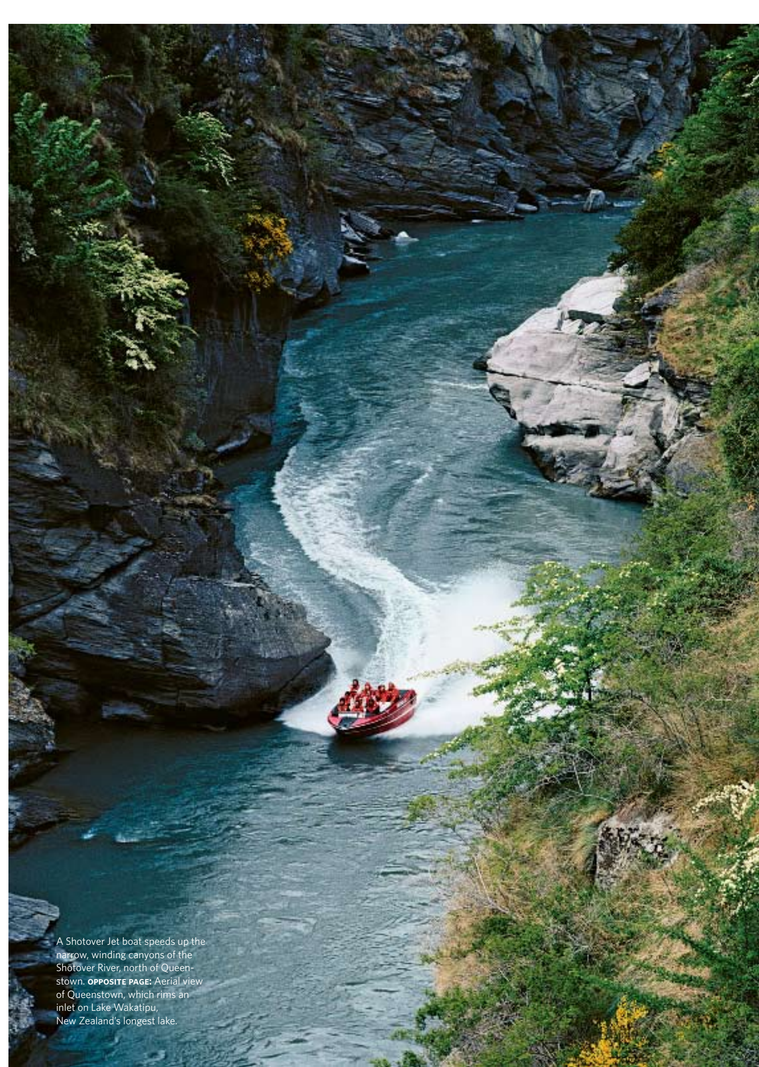
A Shotover Jet boat speeds up the narrow, winding canyons of the Shotover River, north of Queenstown. OPPOSITE PAGE: Aerial view of Queenstown, which rims an inlet on Lake Wakatipu, New Zealand's longest lake.